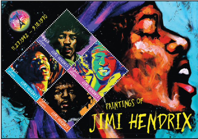
Grenada, Paintings of Jimi Hendrix Sheetlet, issued March 1, 2016

Shown here are four examples from the IGPC Jimi Hendrix Omnibus. For details on these and other topical issues go to the IGPC website, www.igpc.com