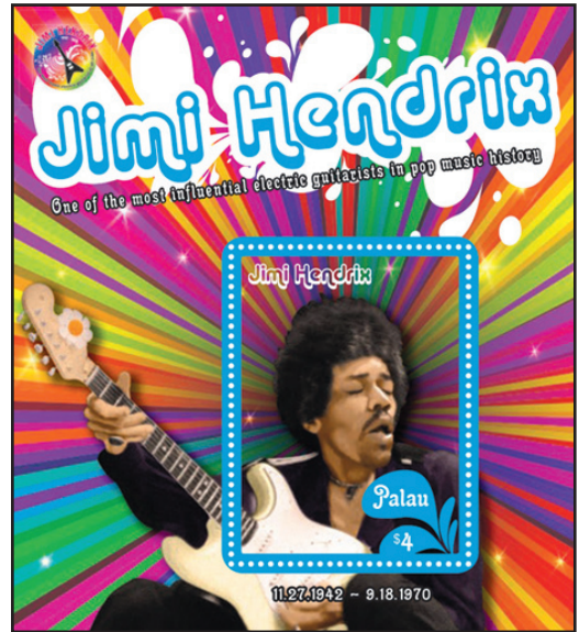
Palau Jimi Hendrix Souvenir Sheet, issued March 8