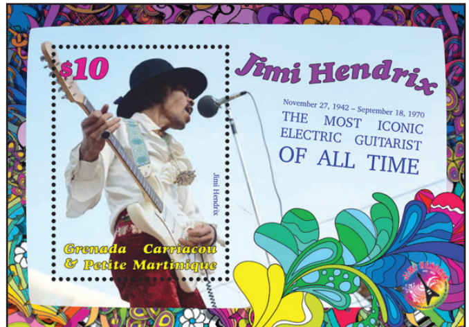
Grenada Grenadines Jimi Hendrix Guitarist Souvenir Sheet, issued March 8, 2016