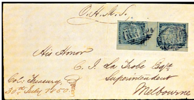
The rare Sydney View 2p blue, Sc. tete-beche pair on cover with interpanneau gutter in between. The stamps are tied by barred ovals. Addressed to the Superintendent in Melbourne, it originated (lower left notation) in the Col.(onial) Treasury, 30th July 1850.