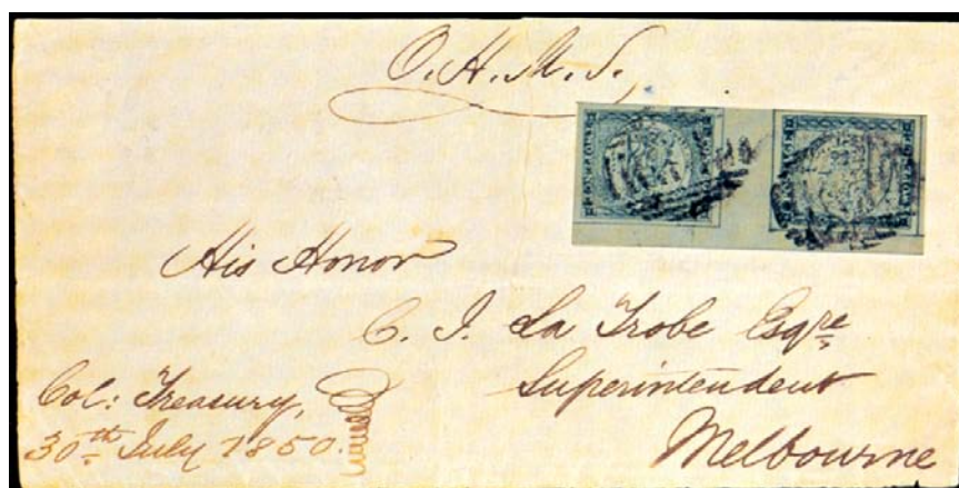
The rare Sydney View 2p blue, Sc. tete-beche pair on cover with interpanneau gutter in between. The stamps are tied by barred ovals. Addressed to the Superintendent in Melbourne, it originated (lower left notation) in the Col.(onial) Treasury, 30th July 1850.