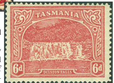
1911 redrawn 6d, Sc. 116, with more color in the river and waterfall and more white in the trees

Pictorials and 5d, 2 1/2d, 10d and 2sh 6d of the Queen's Head issue printed by Messrs. De La Rue of London. The two former have recently run out and the old Queen's Head is now in use for the 5d, as well as the surcharged 1 1/2. Stamps for 1/2, 1, 2, 3, 4,