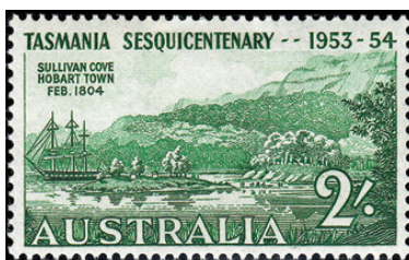
Top to bottom, Tasmania Sc. 1; Australia 286, picturing Tasmania Sc. 2; Australia 263-4 picturing Collins and Paterson; Australia 265 picturing Sullivan Cover, Hobart in 1804.

along with British expenditures on the convict establishments throughout the island. In 1840, a probation system for the convicts was adopted which marked a change in British policy toward the penal system.