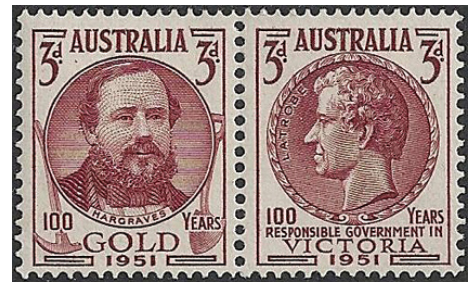
Australia Sc. 244-245

The stamps were made available in July 1951. The design of the former was from a bronze plaque