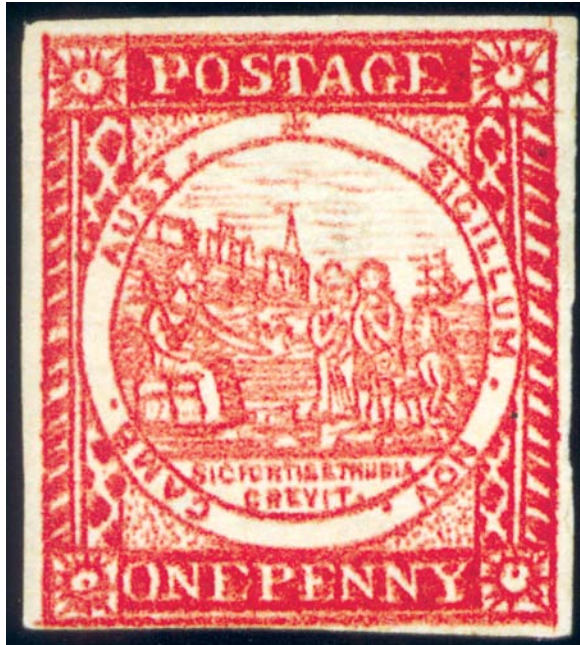
An enlargement of the "Sydney Views" design

Underneath this device is the motto of the Colony—"Sic fortis Etruria crevit"—meaning, "Thus great Etruria grew" while on the circle surrounding the picture is "Sigillum Novae Camb.