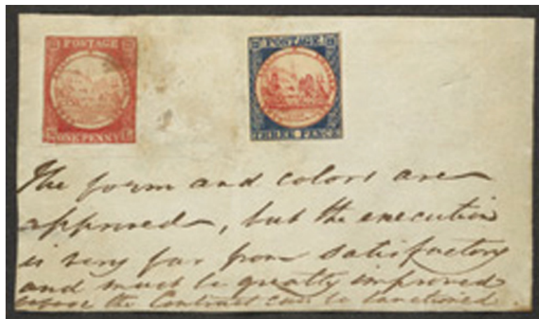
From the British Library Collection: the unique original essays or artwork for the 1d and 3d stamps. The space between the essays was originally occupied by a 2d essay, which is now in The Royal Philatelic Collection.

Underneath this device is the motto of the Colony—“Sic fortis Etruria crevit”—meaning, “Thus great Etruria grew” while on the circle surrounding the picture is “Siggillum Novoe Camb. Aust.”—an abbreviation for...the Latin rendering of “Seal of New South Wales, Australia”. On some of the stamps the bale on which the allegorical figure is seated is plainly dated 1788, which is the date of the foundation of the colony.