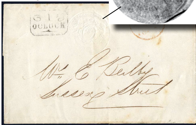
An 1847 folded cover showing the 1838 1d Sydney Embossed Postage, with a computer enhanced detail, in the form of a Seal of the Colony. These were only valid for local carriage.

Altogether it was a somewhat elaborate drawing for any of the rather inexperienced engravers available on the spot to tackle. It will also be noted that in their execution of the design the figures in the foreground are so prominent in contrast with the indistinct view forming the background that it is obvious the intent was to emphasize the value of industry to the new settlers rather than to show a view of the little settlement on the shores of Botany Bay. However, the name "Sydney Views" has become so firmly established by long usage that there is little likelihood of these stamps ever being known by any other name.