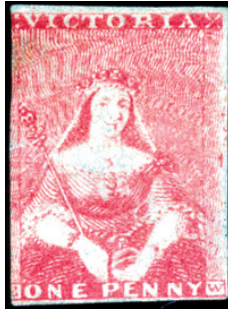
Victoria Sc. 1

In January 1850 the Colony of New South Wales and "Port Phillip District" introduced adhesive stamps, with the classic "Sydney