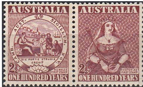
Australia Sc. 228-229

In September 1950 the first of the Commonwealth's "se-tenant" stamps, both 2-1/2d in value (Sc. 228-229), appeared to mark the centenary of the two initial issues, and carry representations, slightly amended, of the N.S.W. and Victorian designs.