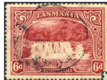
1899 Tasmania 6d, Sc. 93

Take Tasmania, —she evidently had a large stock of 5d, 6d