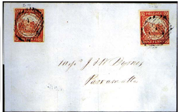
The earliest known use of a Sydney View, the 1p crimson lake (Sc. 1, two copies) tied by barred oval cancels on folded letter, with Sydney circular date stamp and "Parramatta JA 15" (1850) receiver on reverse.

Considering that no really expert engravers were available, such as might be obtained in the busy centers of London, New York, or Paris, and that each stamp on the plate had to be engraved separately by hand, these stamps are quite pleasing in appearance.