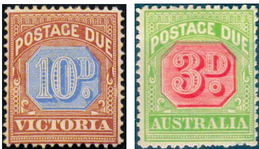
Left, Victoria J7; right, Australia J42, with "Australia" replacing "Victoria"

On May 1st the postage rates over the whole Commonwealth