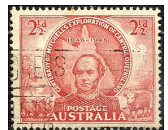
Australia Sc. 203

The exploration of Central Queensland by Lieut. Col. Sir Thomas Mitchell in 1846 was the occasion for commemoration in October 1946 by 2-1/2d, 3-1/2d and 1/- stamps, Sc. 203-205. Assistance in the preparation of the series was given by the Queensland Historical Society. The motif is a central portrait of