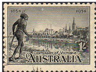
Australia Sc. 144

In October 1934 three stamps (2d, 3d, and 1/-, Sc. 142-144) were distributed to commemorate the centenary of the settlement of Victoria, first known as the Port Phillip District. The stamps show a member of the now extinct Yarra Yarra tribe of aboriginals looking in wonder across the River Yarra at the distant skyline of Melbourne, Australia's largest city, and the State capital.