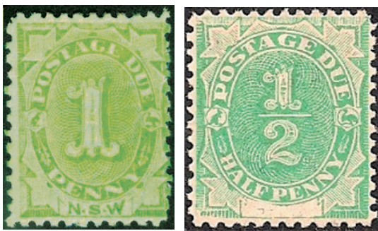
Left, New South Wales J2, with "N.S.W." in tablet at bottom; right, Australia J1, with "N.S.W." removed

First, we find that the New South Wales issue had the initials blocked out and the light green stamps thus changed did duty over the States, except in Victoria, in which the Commonwealth still used the old Victorian type.