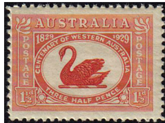
Australia Sc. 103

Three of Australia's six States have already celebrated with special stamps the 100 anniversary of their establishment. In September 1929 Western Australia, originally called "The Swan River Settlement," produced a 1-1/2d stamp for the occasion. The motif is a Black Swan, the emblem of Western Australia, and the designer was G. P. Morrison, Curator of the National Gallery, Perth. Swan River, on which Perth, the State capital, is situated, was discovered in 1697 by the Dutchman de Vlaming, who recorded for the first time the existence of black swans.