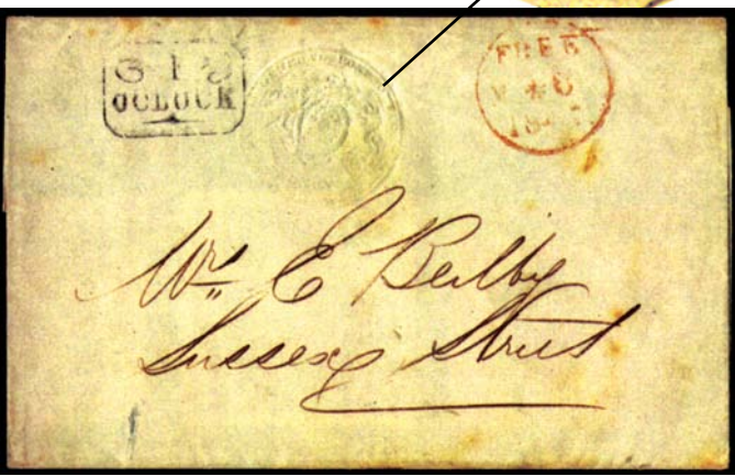
An 1847 folded cover showing the 1838 1d Sydney Embossed Postage, also in the form of a Seal of the Colony. These were only valid for local carriage.

The 1 penny (1d), 2d and 3d “Sydney Views” values use a design by Robert Clayton printed on white to yellowish paper, the 1d in lake, pale red or carmine while on bluish paper in pale red and lake.