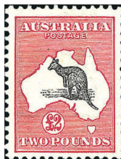
The "new Federal issue" turned out to be the now-famous Kangaroos, this one being the 1913 first issue high value, Sc. 15

pers, watermarks and perforations will pass away with the separate issues of the States, which have been the victims of Federal mismanagement, instead of the culprits, as is generally imagined.