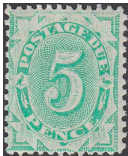
Australia J14, with a scroll where the "N.S.W." tablet had been

were made uniform, with 1d postage over the whole British Empire from Australia, and following on the universal use of State stamps within the Commonwealth. This was the second concession we have had since Federation, both granted by our present Labour government, who, if not such good talkers, are better doers than their predecessors in the Postal Department.