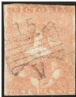
Left, orange vermillion right, dull red

unused example of the orange vermillion, but the color is off from the actual color; however, it