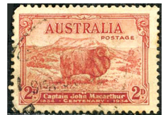
Australia Sc. 147

The first bale of wool exported overseas by Macarthur sold at 10/4 [10 shillings / 6 pence] a lb. in 1807. On these stamps (2d, 3d and 9d, Sc. 147-149) a champion merino ram, sold in 1934 for £6,000, takes pride of place. The animal is shown against the Blue Mountains at Camden on the Nepean River, New South Wales, the site of Macarthur's 5,000 acre estate. Macarthur was a notable figure in the politics of the then colony.