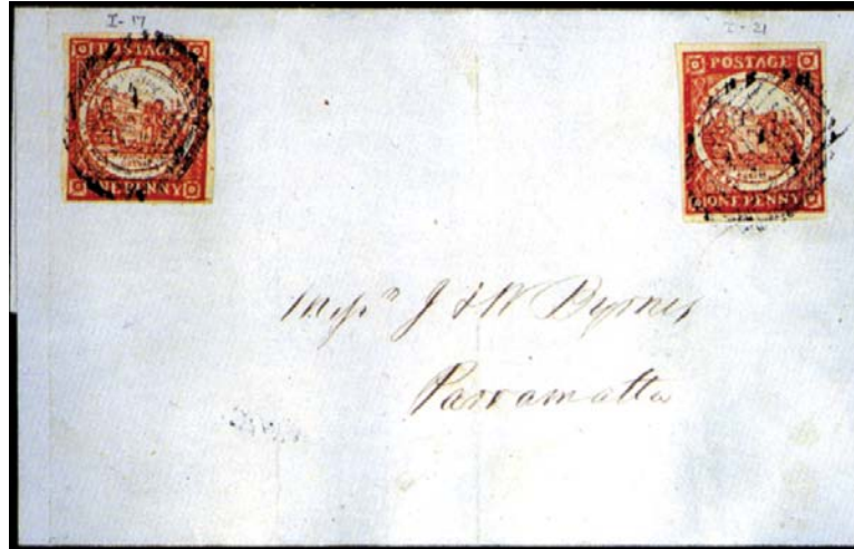
The earliest known use of a Sydney View, the 1p crimson lake (Sc. 1, two copies) tied by barred oval cancels on folded letter, with Sydney circular date stamp and "Parramatta JA 15" (1850) receiver on the reverse.

Altogether it was a somewhat elaborate drawing for any of the rather inexperienced engravers available on the spot to tackle. It will also be noted that in their execution of the design the figures in the foreground are so prominent in contrast with the indistinct view forming the background that it is obvious the intent was to emphasize the value of industry to the new settlers rather than to show a view of the little settlement on the shores of Botany Bay. However, the name "Sydney Views" has become so firmly established by long usage that there is little likelihood of these stamps ever being known by any other name.