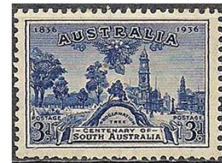
Australia Sc. 160

Melbourne, named after Viscount Melbourne, the then Prime Minister of England, was founded in 1835 by John Batman. Pictures of Adelaide, capital of South Australia, as a tent-town of 1836, and as a city a century later, figure on three additional Centenary stamps (2d, 3d and 1/-), Sc. 159-161. To commemorate the foundation of South Australia as "a Province of the Crown," by Captain John Hindmarsh, R.N., in December 1836 the stamps appeared in August 1936. The Proclamation ceremony was staged beneath an arched gum (eucalyptus) tree at Glenelg, a seaside resort six miles from Adelaide. This "Proclamation Tree" is the central design of the stamps. Also in the picture is the Adelaide