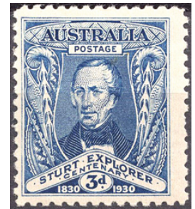
Australia Sc. 105