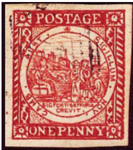
New South Wales Sc. 1

Mitchell, explorer, Surveyor-General, soldier and writer, materially assisted by his 1846 journey in opening up Central Queensland.