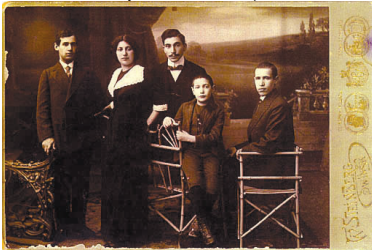
Marcus Rothko, 2nd from the right in 1912.

On September 25, 1903 Latvian-American painter Marcus Rothkowitz was born in Daugavpils, Latvia (formerly Dvinsk, Russia). After leaving Russia in 1913 the Rothko family emigrated to the United States and settled down in Portland, Oregon. From 1921 until 1923 Mark Rothko studied at Yale University, thanks to a scholarship he received. After his schooling he moved to New York City where in 1925 he met and studied under Max Weber at the Art Students League. Just three years later Rothko participated in his first group exhibit.