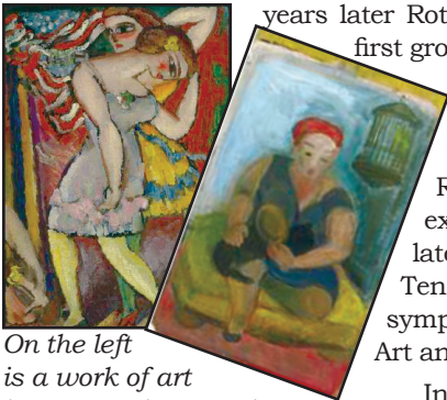
On the left is a work of art by Max Weber. On the right is Rothko's, "The Cat and the Canary" done in a similar style to Weber.

On September 25, 1903 Latvian-American painter Marcus Rothkowitz was born in Daugavpils, Latvia (formerly Dvinsk, Russia). After leaving Russia in 1913 the Rothko family emigrated to the United States and settled down in Portland, Oregon. From 1921 until 1923 Mark Rothko studied at Yale University, thanks to a scholarship he received. After his schooling he moved to New York City where in 1925 he met and studied under Max Weber at the Art Students League. Just three years later Rothko participated in his first group exhibit.