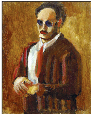
Rothko's Self Portrait, completed during his time with the FAP project.

Progress Administration (WPA) Federal Art Project (FAP). The FAP was a way to get unemployed artists back to work. For eight years a broad range of artisans, all with different levels of experience and working in a variety of mediums, were producing art, with over 5,000 artists working in 1936 alone. The art that came about as a result of this project was distributed all over the U.S. in an effort to spread artistic expression to areas where it had previously been absent.